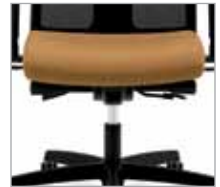
SYNCHRO-TILT WITH BACK ANGLE Offers the broadest recline range and gives the user maximum control over every aspect of their posture.