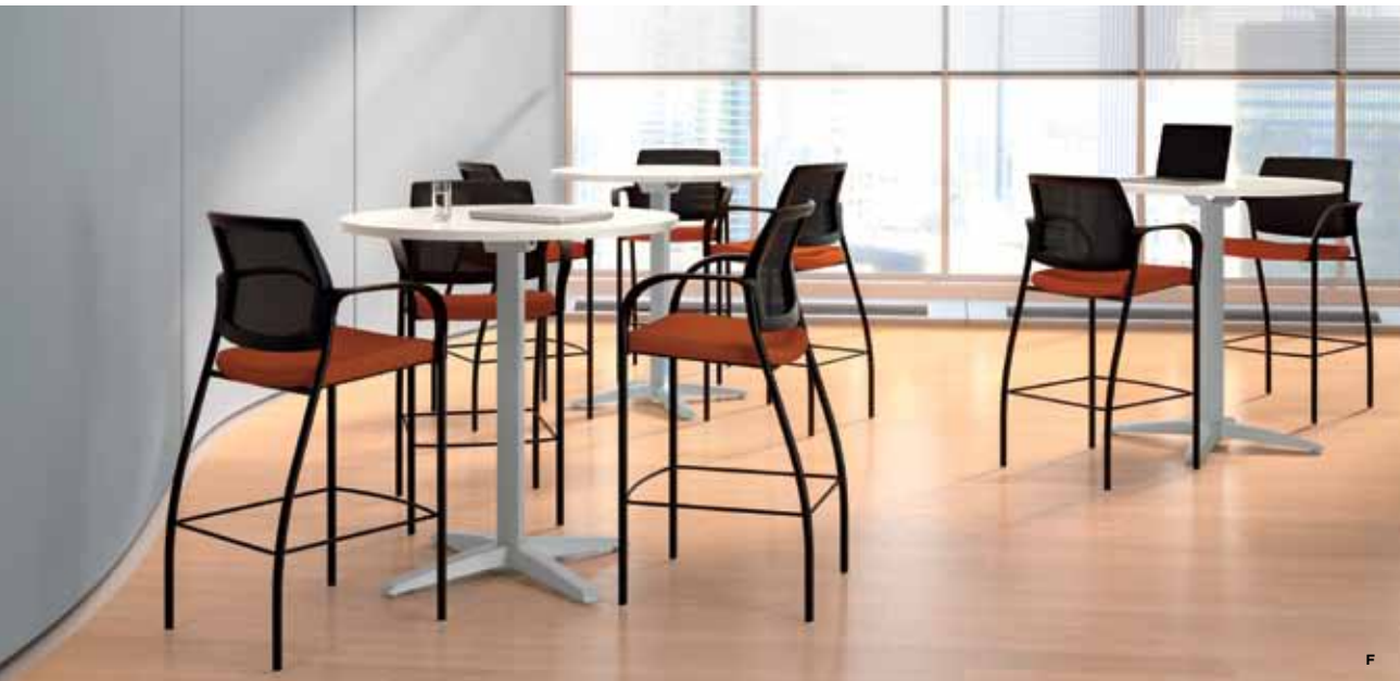
CAFÉ This environment requires mobility and flexibility, which makes it perfect for Ignition's café stools.