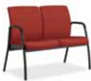
TWO SEAT LOUNGE