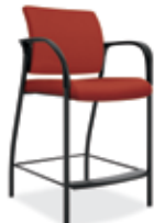
HIP CHAIR For Healthcare Applications