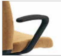
FIXED C-ARMS Black

Personalize your comfort and style with Ignition's fixed and adjustable arm options.