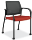
MULTI-PURPOSE STACK CHAIR W/ARMS