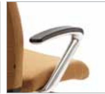
FIXED C-ARMS Polished Aluminum