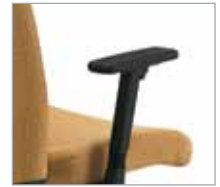
ADJUSTABLE T-ARMS Black - Height, Depth, Width Adjustments