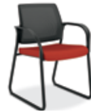
MULTI-PURPOSE SLED BASE W/ARMS