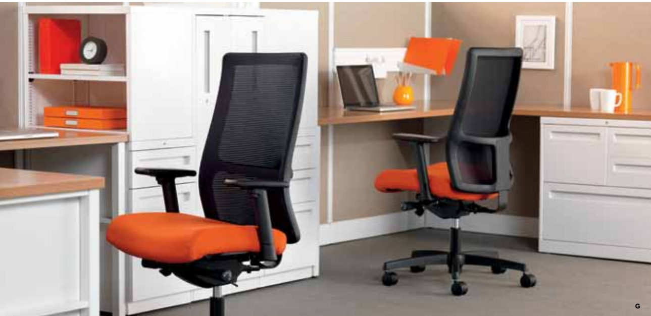
WORKSTATION Ergonomic task seating makes it easy to focus and increases worker productivity.