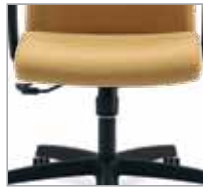
CENTER TILT With this popular control, the front of the seat rises to the same degree the back reclines, to support daily office activities.

Seat depth has a 3" range for optimal user comfort and tilt recline to 120° for select models add to Ignition's already impressive control performance.