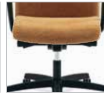
SYNCHRO-TILT This enhanced tilt function brings the spine into more natural alignment, and opens the torso to improve leg circulation.