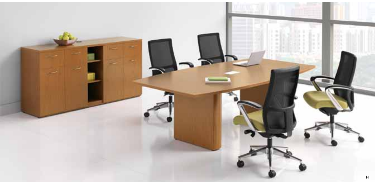
CONFERENCE Support your dedicated meeting spaces with luxurious comfort and personalized controls.