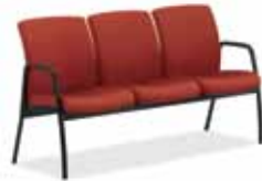
THREE SEAT LOUNGE